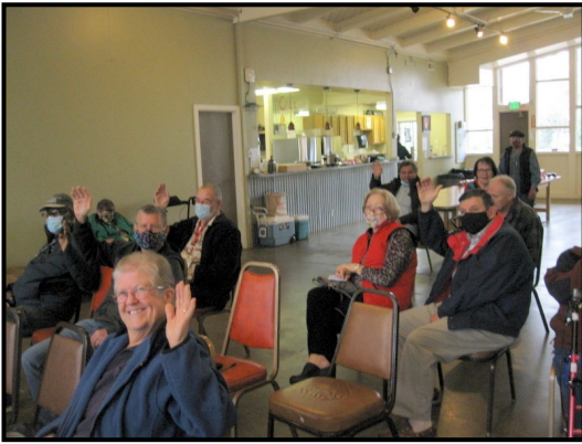
A full room of raised hands indicated approval of the added $500 to this year's charitable donation.