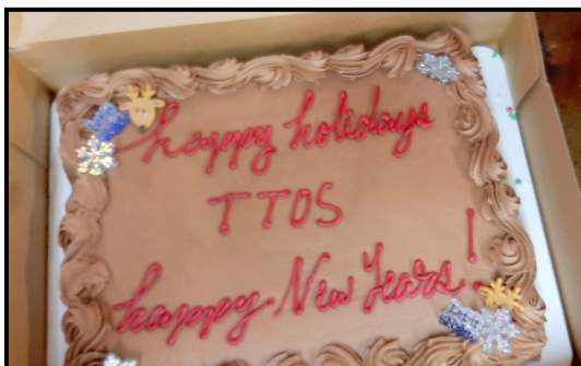
The cake