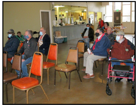
Members stay tuned in to speakers as other members in the kitchen area start setting up the buffet goodies for our Christmas Party luncheon.