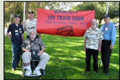
Sacramento Valley Division's Board of Directors pose around our club's new and colorful banner. The breeze-blown banner faced the oncoming westbound traffic nearing the Scottish Rite Center.