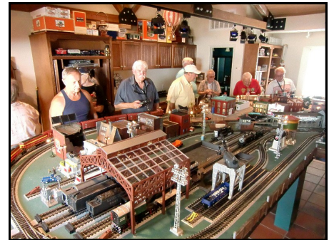
Panoramic view of the locomotive service facility.