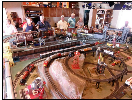
The Lionel dealer layout (foreground) is the centerpiece of Dean's layout.