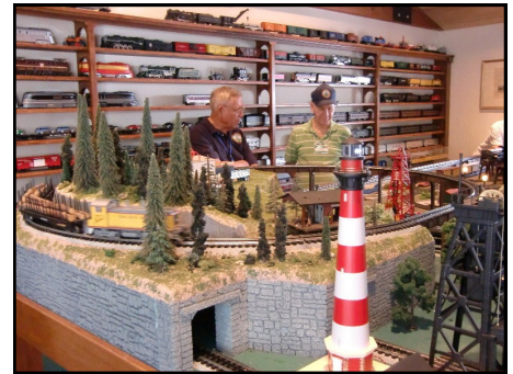
Timber is the chief industry along the mountain division.