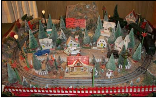
The Pineville O-gauge Christmas layout