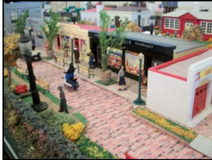
Plasticville street scene