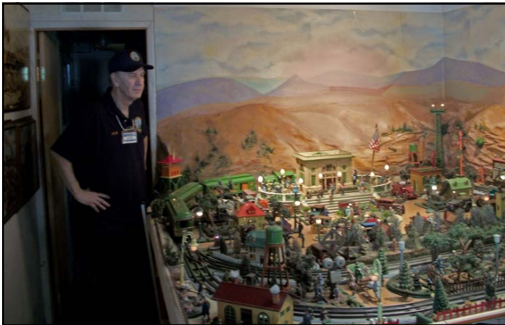
Jack's beautifully-decorated Standard Gauge layout