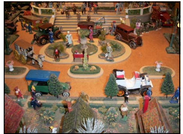
Period autos pick up and drop off passengers at the station on Jack's Standard Gauge layout